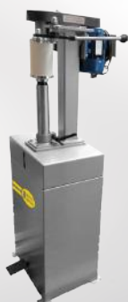
Semi-automatic closing machine cans / tubes ZPP