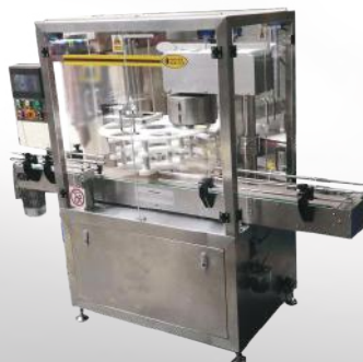
Automatic closing machine for cans / tubes AZP/S 30