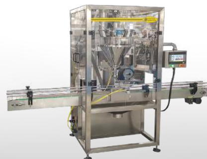
Packaging line for powdery products SDP/S 500 A