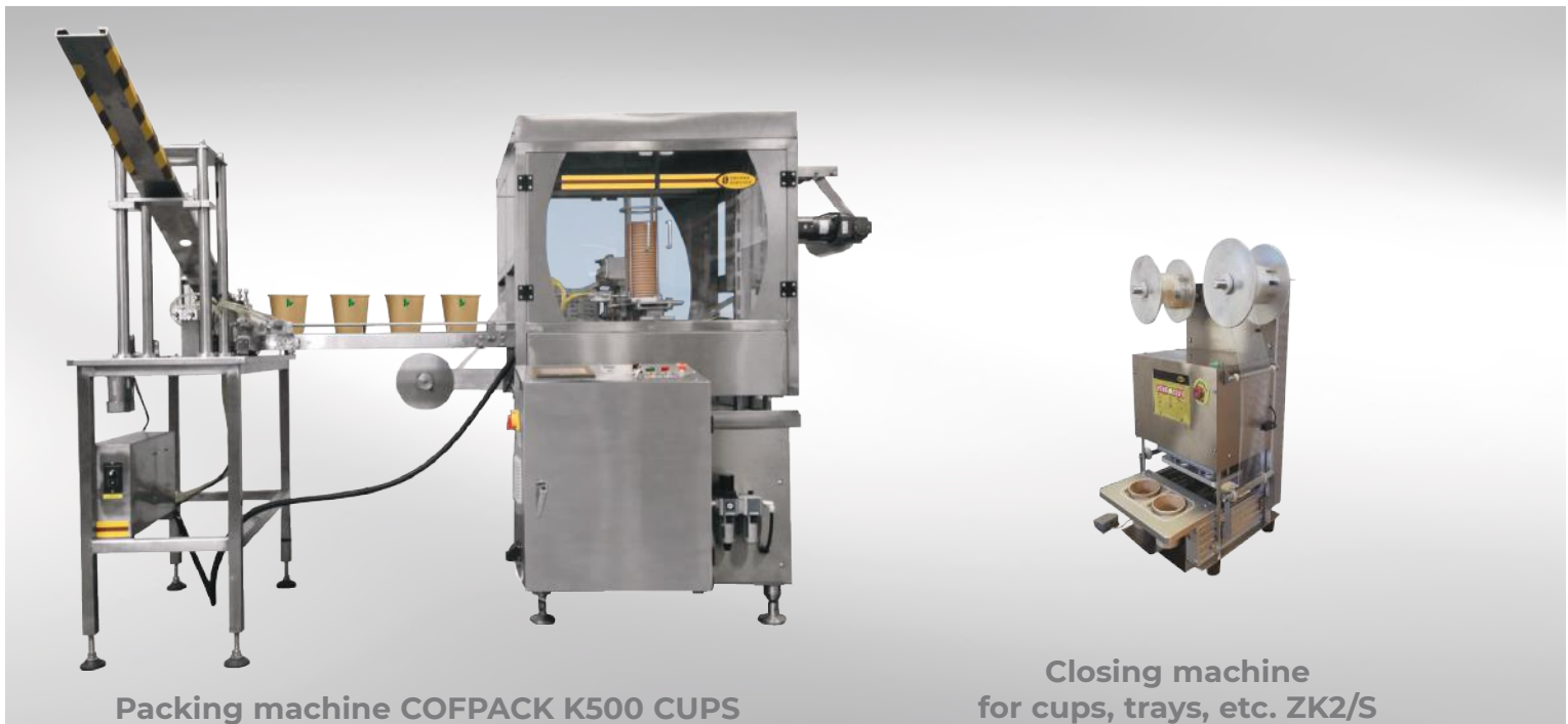
Packing machine COFPACK K500 CUPS