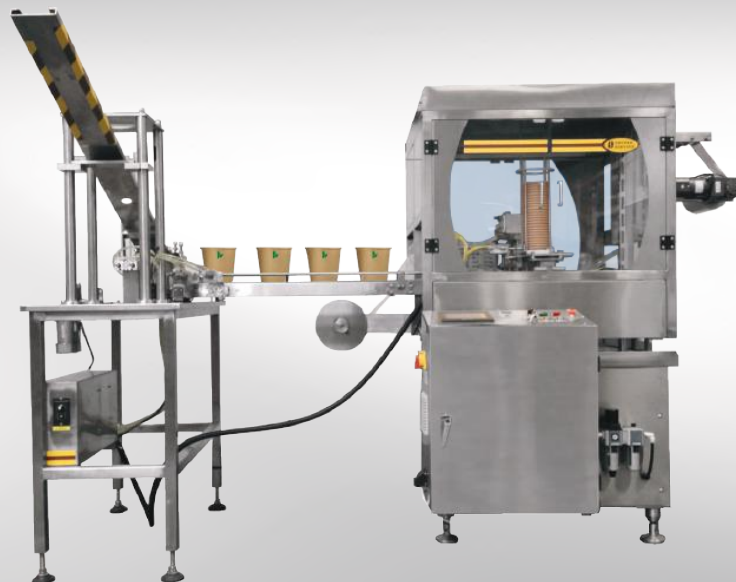
Packing machine COFPACK K500 CUPS