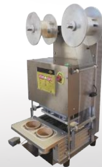
Closing machine for cups, trays, etc. ZK2/S