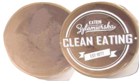
lid from the inside with a membrane