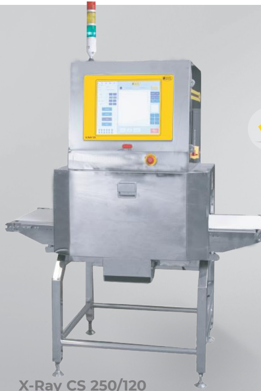
X-Ray CS 250/120