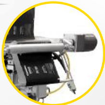
electric reel unwind