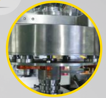
volumetric filler DO