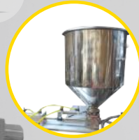
thick liquid filler DPG