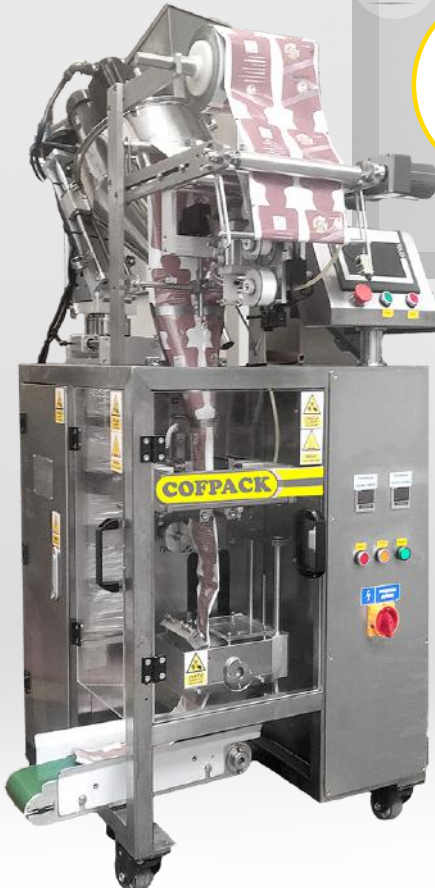
Packing machine COFPACK SACHET SS