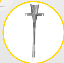
additional forming set