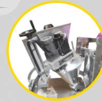
auger filler SS