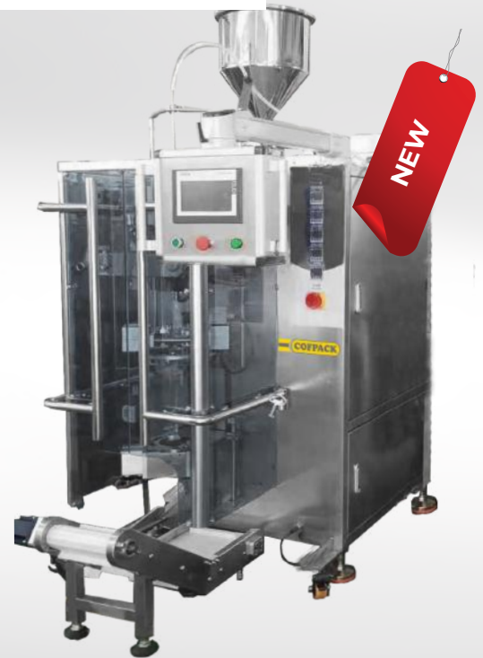
Packing machine COFPACK SACHET SHAPE DPG