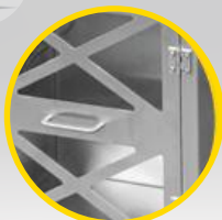
product container with closure