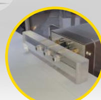
T - punch rejector