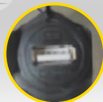
data extraction by USB