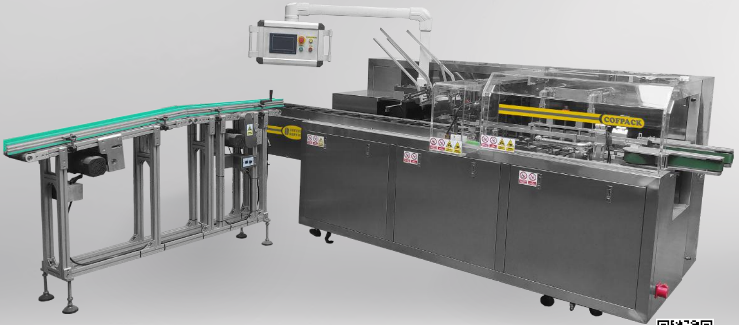
Cartoning machine COFPACK KRTM/S 50