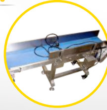
take-away conveyor OGTP/S