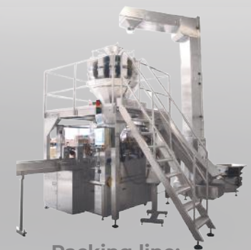
Packing line: COFPACK DOYPACK K 8-50 + DWK 10 + PWK 2000 + PRZ 3750