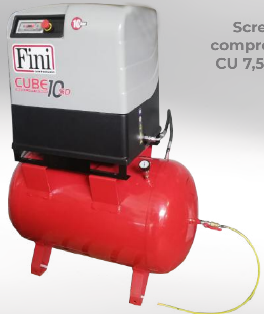
Screw compressor CU 7,5/270