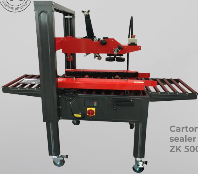
Carton sealer ZK 500