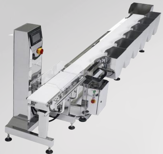
Weight Sorters SW