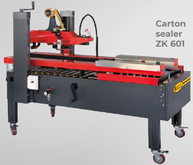
Carton sealer ZK 601