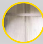
additional folded filter