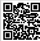
Screening Machine SWO/S 400/2