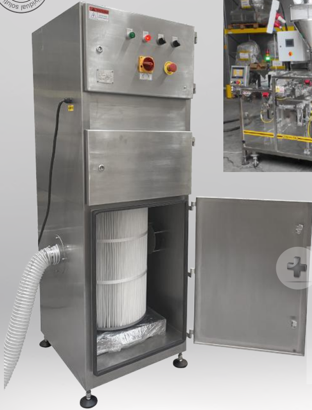
Dust collector AP/S 2.2