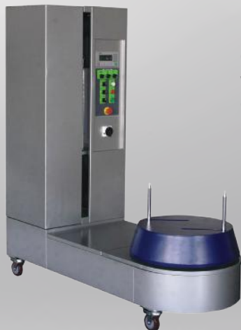
Carton wrapper OK 900