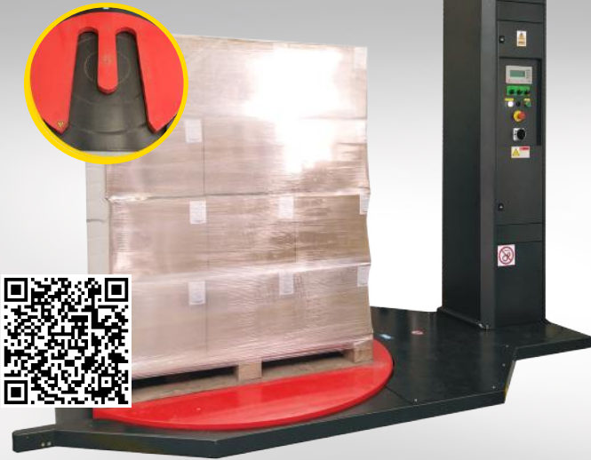
Pallet wrapper 2000