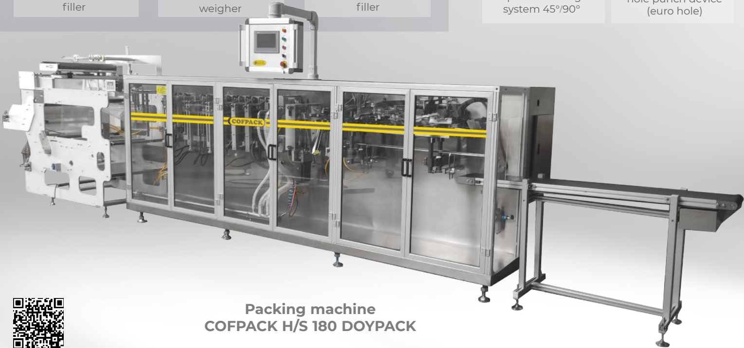
Packing machine COFPACK H/S 180 DOYPACK