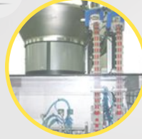
spout inserting system 45°/90°