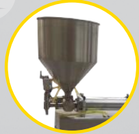
thick liquid filler