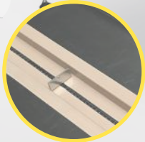
pushers witch chain