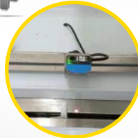
no product no bag