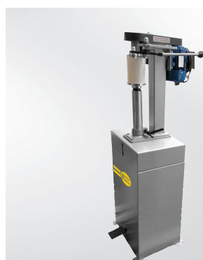
Semi-automatic closing machine cans / tubes ZPP