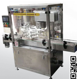
Automatic closing machine for cans / tubes AZP/S 30