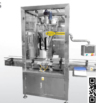
Packaging line for powdery products SDP/S 3000 A